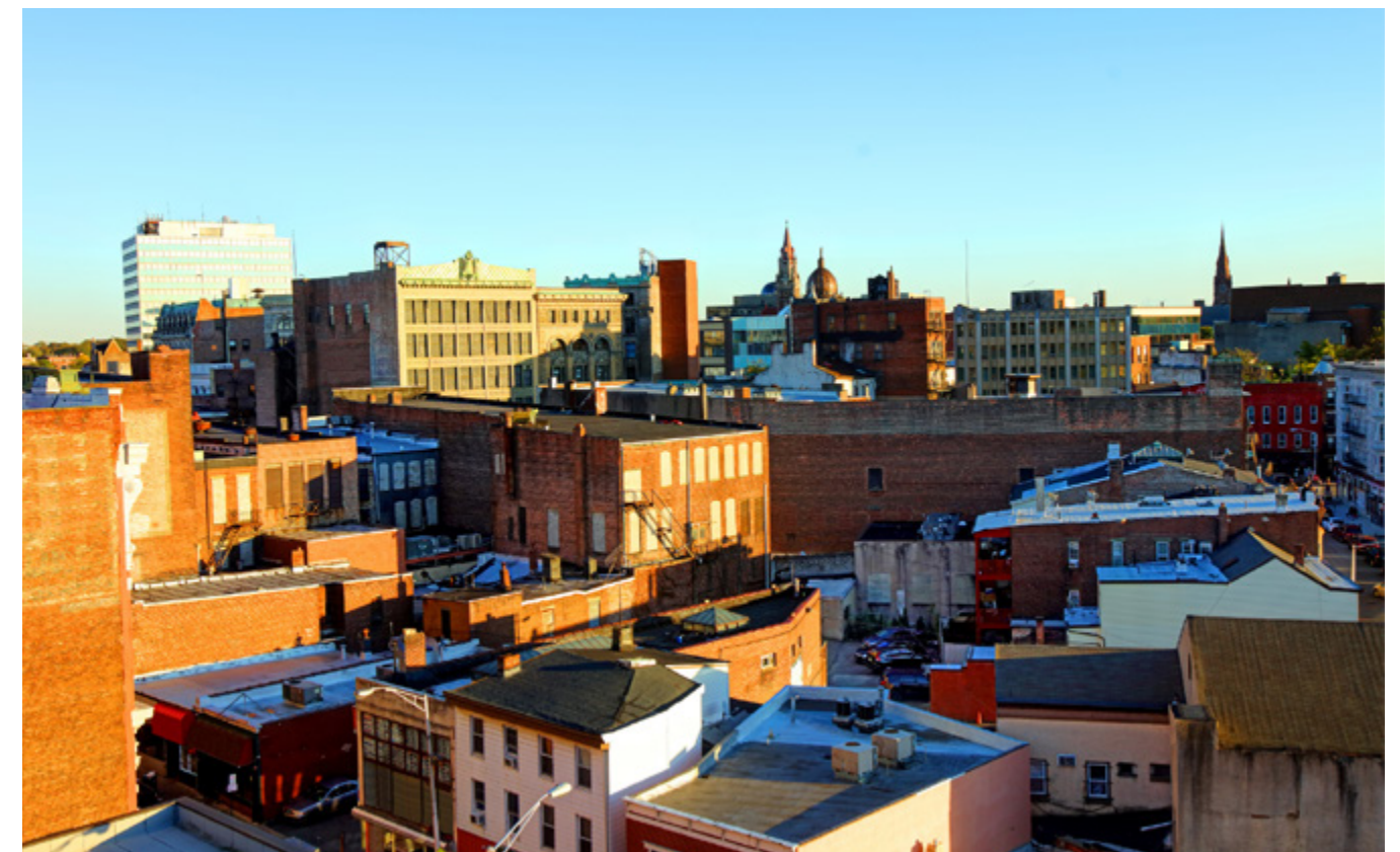
Paterson, NJ, today.

As we continue to adapt to serve our clients, we're mindful of the role of legal services in the struggle for equality in this country. We want to be not just a provider of services, but an instrument of change. In these pages you will meet some of the people whose commitment, resourcefulness and hard work creates that change, every day.