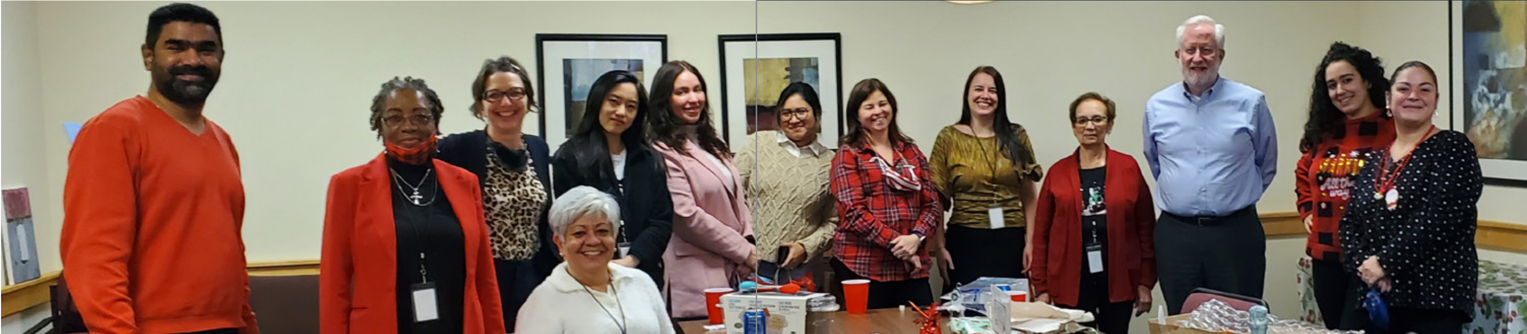
Staff in our Jersey City office gathers for a holiday gift exchange (and quick photo sans masks!) in December, 2021.