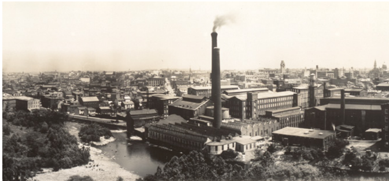
Paterson, NJ, a century ago.